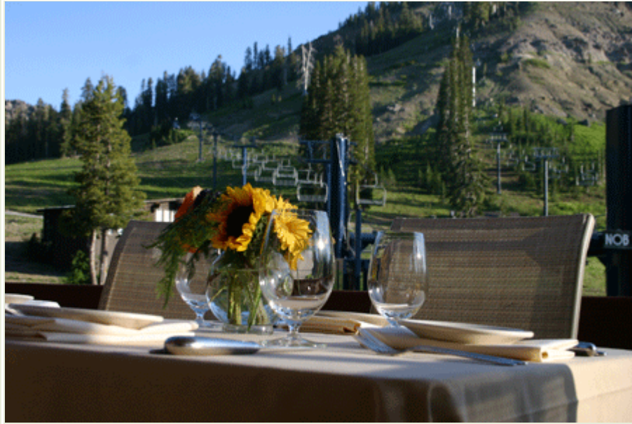
Patio style dining at Sugar Bowl's Lake Mary Cabin